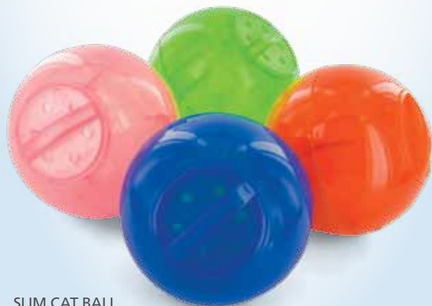
SLIM CAT BALL

Among all cat species, only lions hunt and eat together. In a natural setting, cats will hunt and eat 10 or more small meals per day. One way to mimic this natural hunting behavior is to use a 'foraging feeder' or 'food puzzle' where your cat has to interact with the feeder to get small pieces of food (e.g., Slim cat ball, Egg-cersizer, etc.) You can also hide small amounts of dry food around the house for your cat to seek out and eat, perhaps in shallow plastic containers or egg cartons.